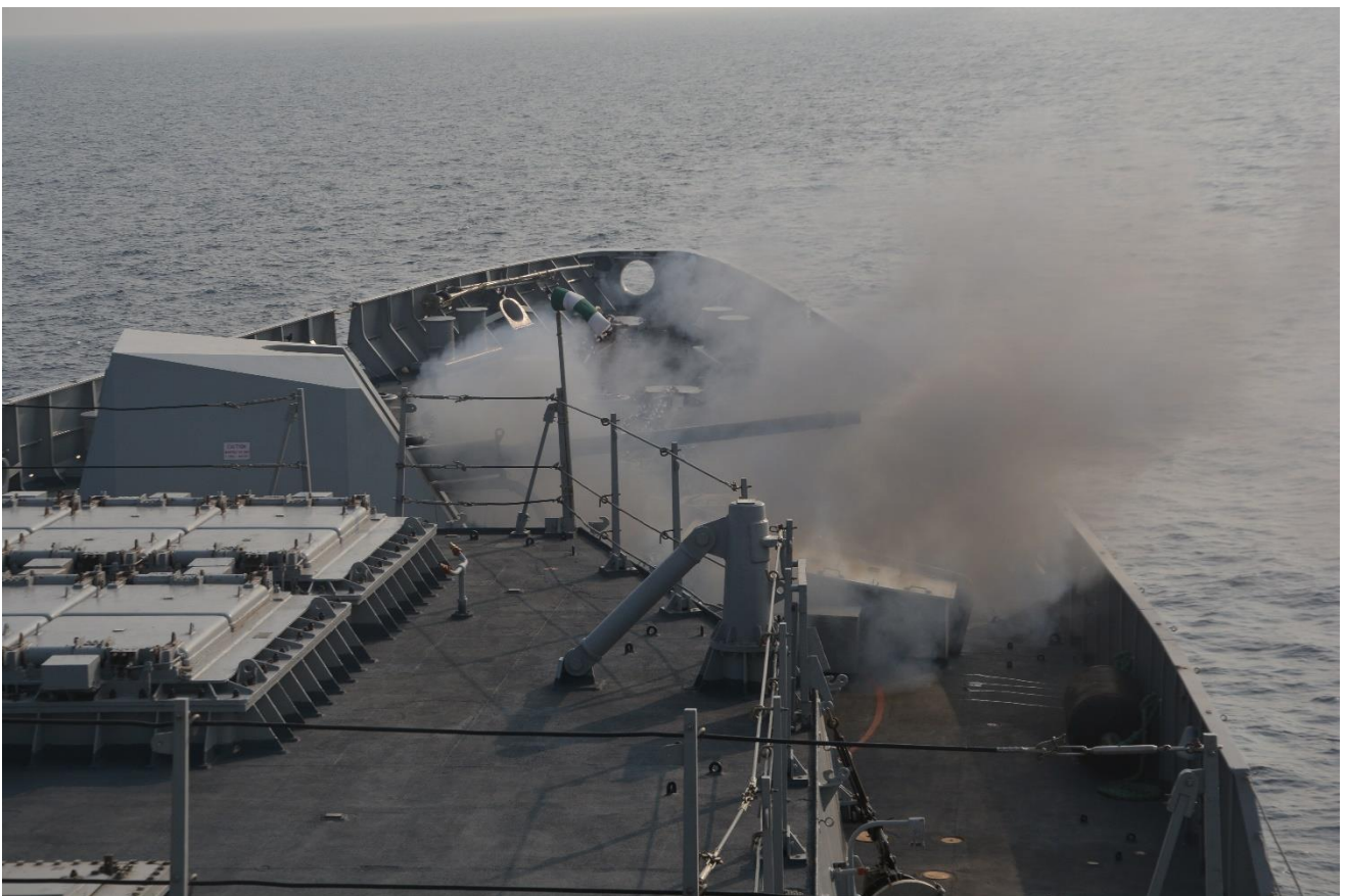
HMS Dragon fires its 4.5 gun

This Christmas, please give a thought for the ship's company of HMS Dragon deployed near the Indian sub-continent doing vital tasking while other RN ships' companies enjoy leave with their families. The safe arrival of goods shipped in containers, or shipped as bulk cargoes in specialised ships often use busy but potentially vulnerable sea routes that need the effective protection of friendly naval forces working together to deter those who would prefer to disrupt the shipping traffic.