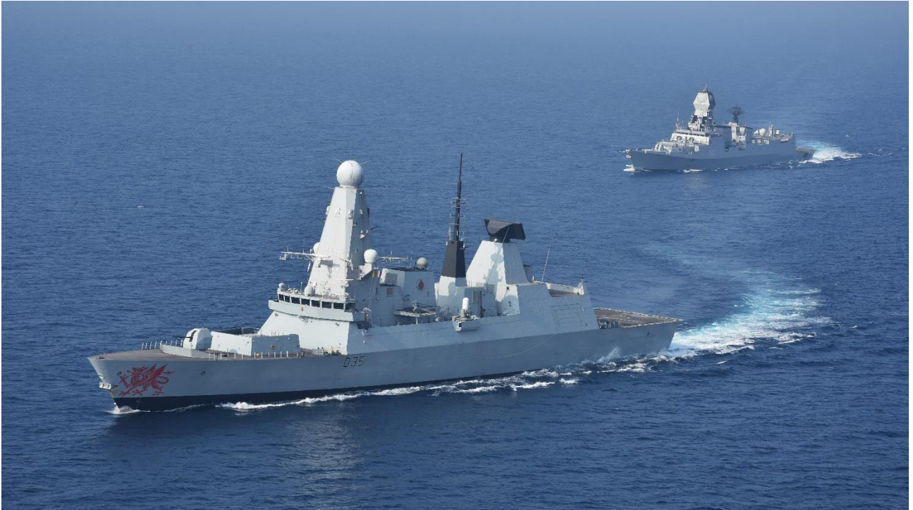
HMS Dragon and Indian Naval Ship Kolkata

During December, Indian Naval Ship (INS) Kolkata has been involved with KONKAN exercises with HMS Dragon. The Konkan exercise provides a platform for the two navies to periodically exercise at sea and in harbour, so as to build interoperability and share best practices.