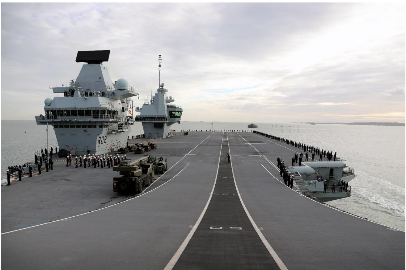
Aircraft carrier, HMS Queen Elizabeth, returns to Portsmouth after successfully completing initial fast jet trials

Defence Secretary Gavin Williamson said: "HMS Queen Elizabeth's inaugural deployment to the US has not only marked the return of the Royal Navy's carrier strike capabilities, but also strengthened our special relationship with US forces. A true statement of our global reach and power, this ship will serve the United Kingdom for generations to come, keeping the nation safe and supporting our allies as we navigate increasing threats."